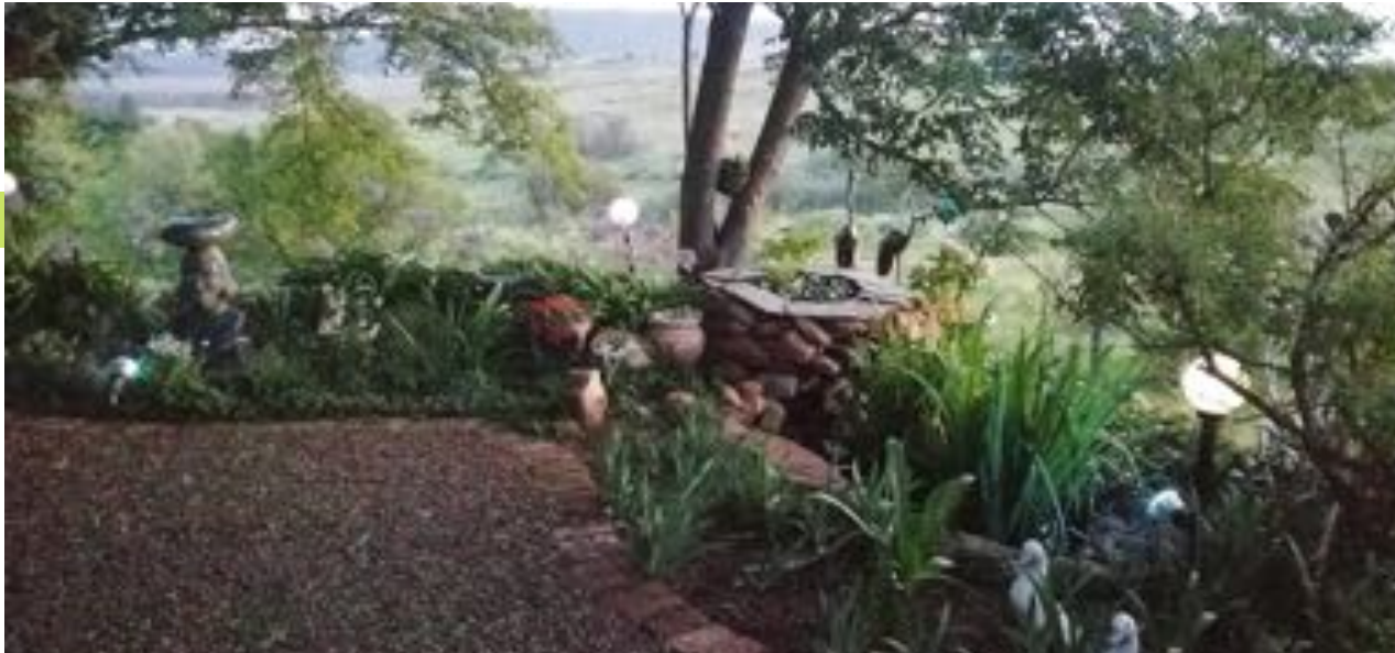
Desre Menezies Garden