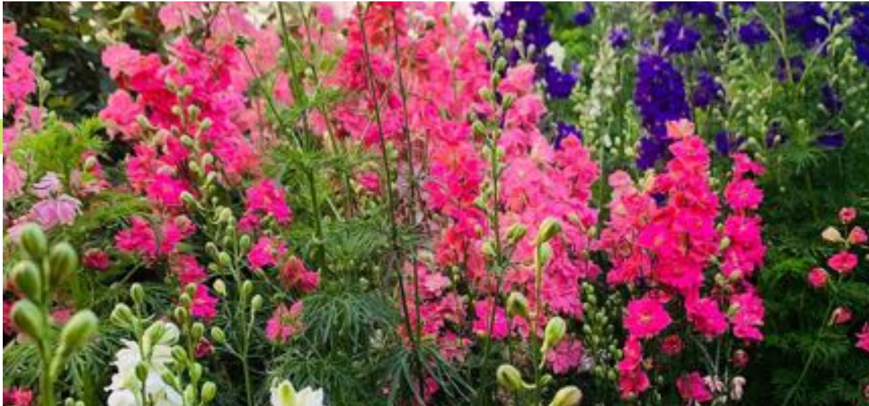
Jimie Malan's Garden - Malanseuns